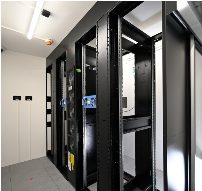
MultiSensor-TI in the Fix Container server room