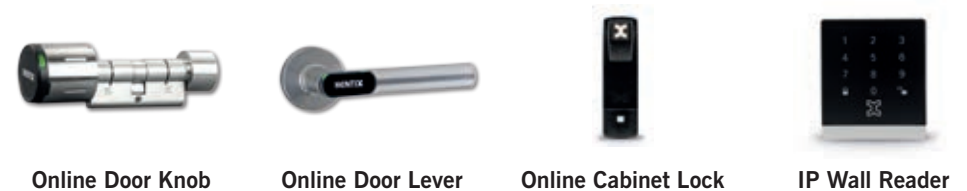
Online Door Knob