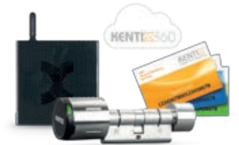
AccessPoint, Online Door Knob and Master Card Set

ENTIRE SOFTWARE ALREADY INCLUDED – NO ADDITIONAL COST!